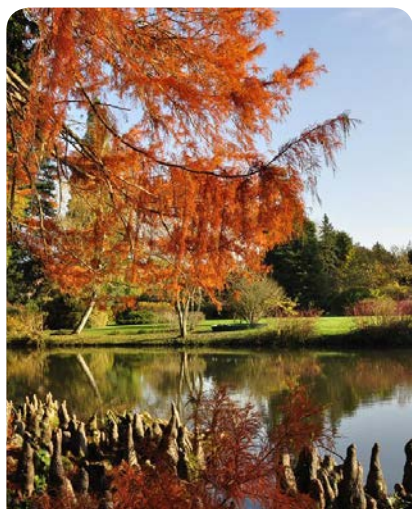
Strolls and relaxation at the Balaine (Allier) arboretum