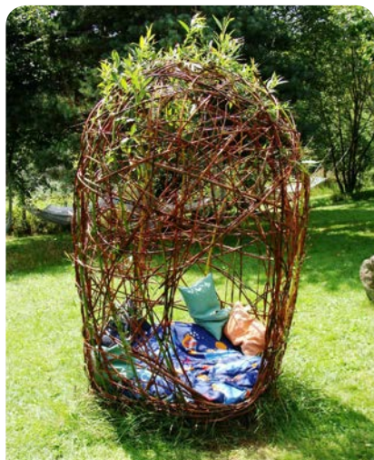
Taking you by surprise! Bassignac (Cantal)