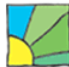
Gardens of the Massif Central